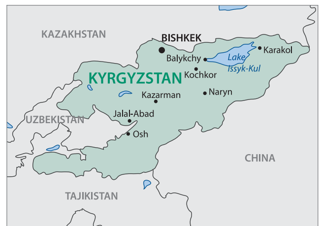
Figure 3.2: Kyrgyzstan geographical map.

Kyrgyzstan is a mountainous, landlocked country in Central Asia with a population of approximately 6.2 million. Bishkek, the capital and largest city (population 850,000) is in the north close to the Kazakhstan border. The other major population centres of Osh and Jalalabad are located in the south, where the majority of the population live, and where there are plentiful valleys and plains with more plowable land available for agriculture.