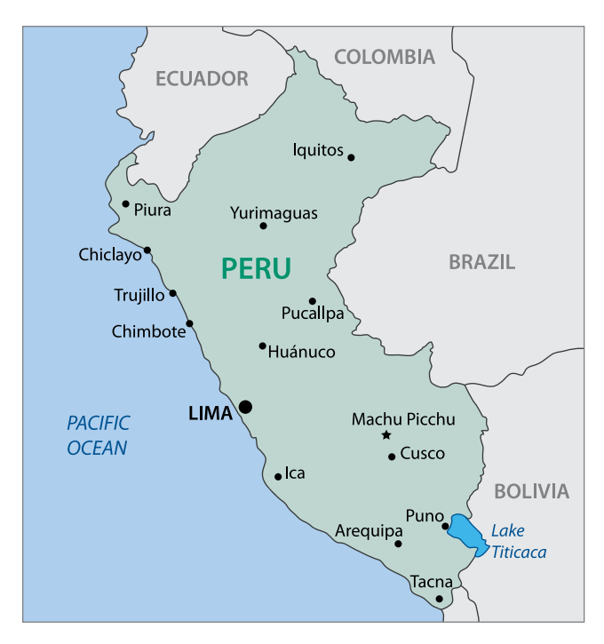
Figure 6.2: Peru geographical map.