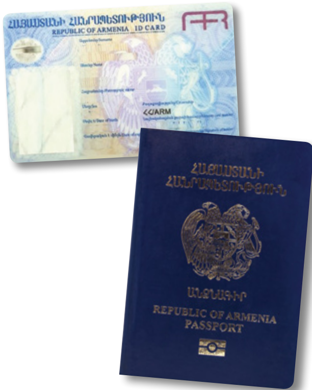
Figure 1.7: Armenian national ID card and electronic travel document.

Over time, as civil registration archives are digitized, people will no longer need to present civil registration certificates. Then the population register will truly reflect all layers of identity data that the Civil Status Acts Registration Agency (CSARA) has registered. When citizens register vital life events, all their identity data will be pulled directly from the population register. When they request a new ID card or a travel document, their identity data in the population register will reflect all registered vital events. If they need a document with data that does not match what is in the population register, this difference will first need to be reflected in the civil register, where it is registered as new vital event.