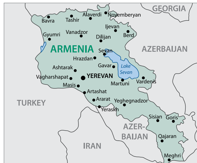
Figure 1.2: Armenia geographical map.

Under the old Soviet central planning system, Armenia developed a modern industrial sector. It supplied machine tools, textiles, and other manufactured goods to sister republics in exchange for raw materials and energy. Armenia has since switched to small-scale agriculture and away from the large agro-industrial complexes of the Soviet era. Armenia has two open trade borders: Iran and Georgia. Its borders with Azerbaijan and Turkey have been closed since 1991 and 1993, respectively. This is due to Armenia's conflict with Azerbaijan over the Nagorno-Karabakh region.